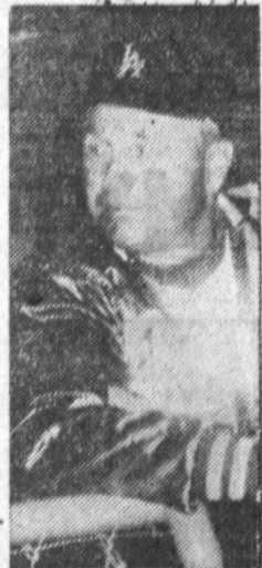
ALSTON

The boys flew in last night from that disastrous short junket to the mid-west. Looking, disgusted, and forlorn were Sandy Koufax, who couldn't get a man out in St. Louis; Stan "Not the Man" Williams, suffering from control problems; little Danny MacDevitt trying to hide behind big Tommy Davis and a pondering Clem Labine, who wonders if this is his last year as a Dodger reliever.