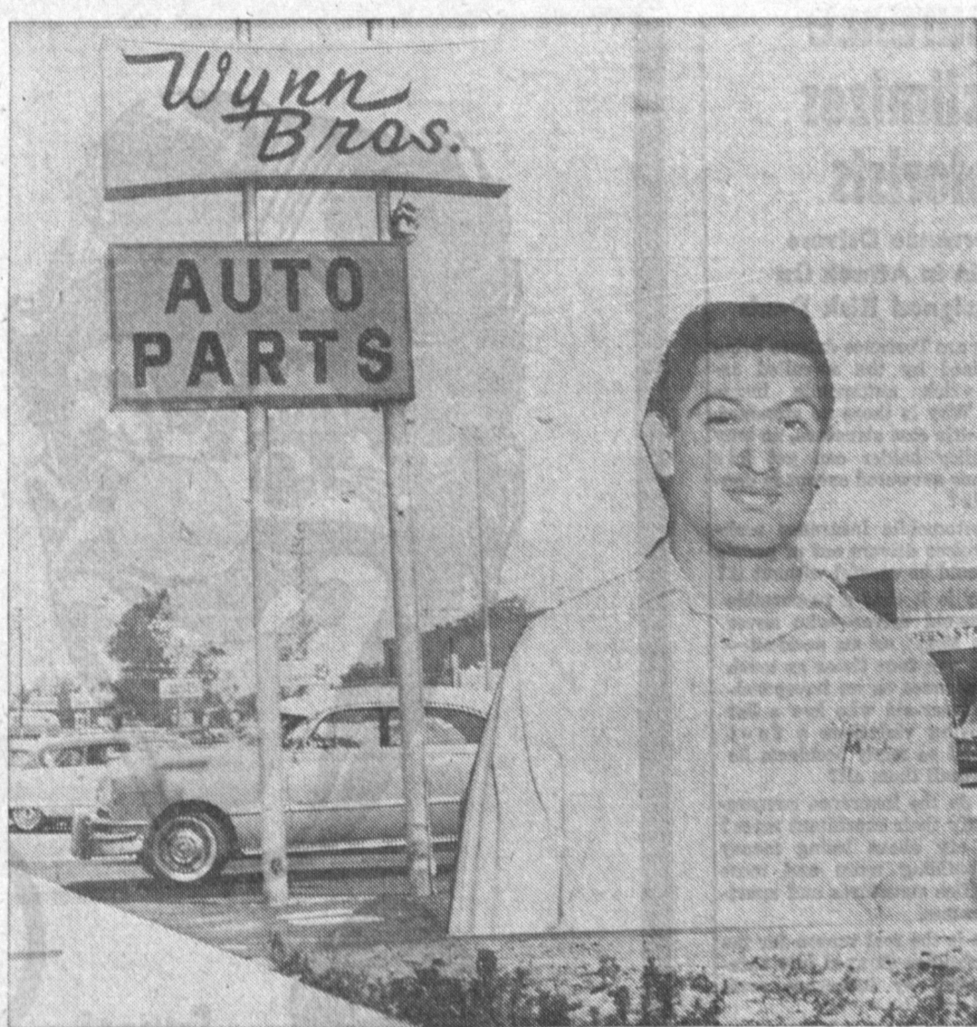
NEW WYNN BROS. OPENS IN TORRANCE