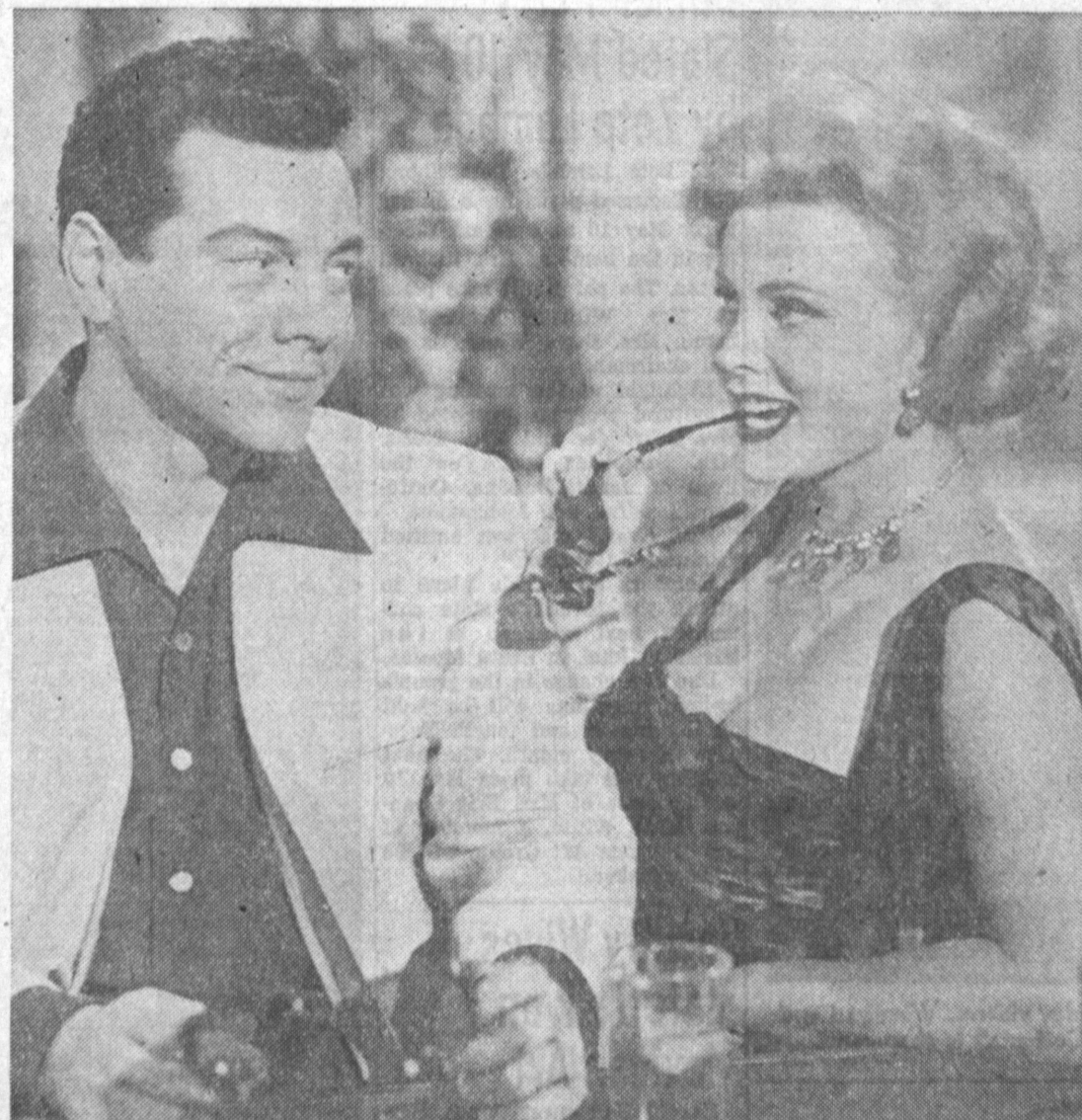
ON SCREEN HERE—Mario Lanza, Zsa Zsa Gabor star in color film, "For the First Time," at Roadium Drive-in. Companion bill is "Seven Little Foys" with Bob Hope, Jas. Cagney.

DRIVE-IN THEATER Redondo Beach Blvd. DA 4-2664