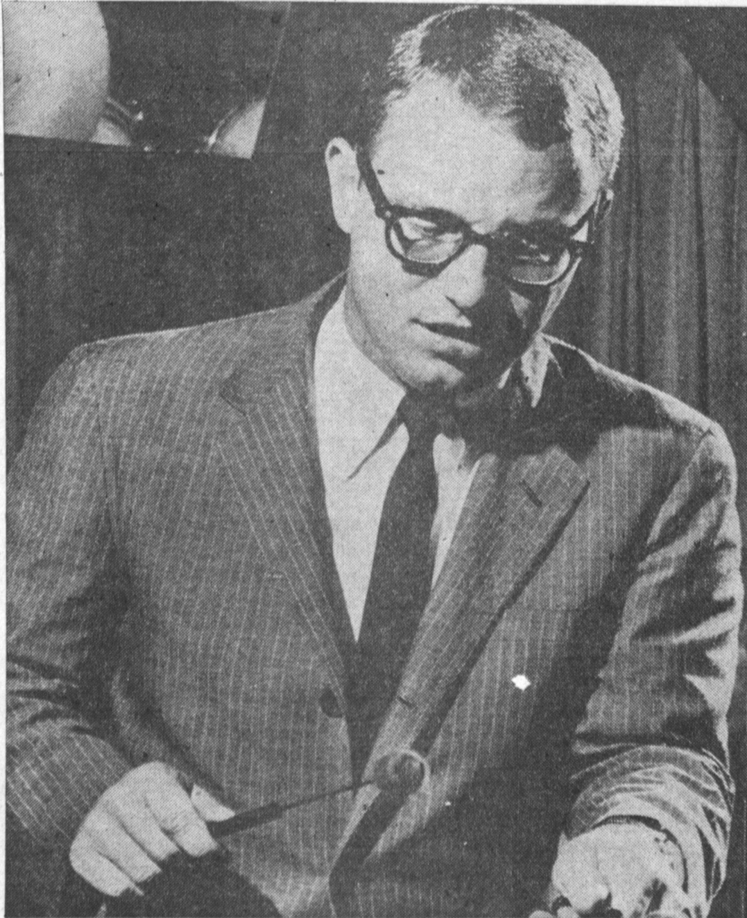
BOOKED—Cal Tjader, one of the most famous of modern jazzmen, will appear at El Camino with equally famed Hi-Los.

A Southwood GI resale home is being offered for $15,950. It can be seen south of 190th St. and west of Hawthorne Blvd.