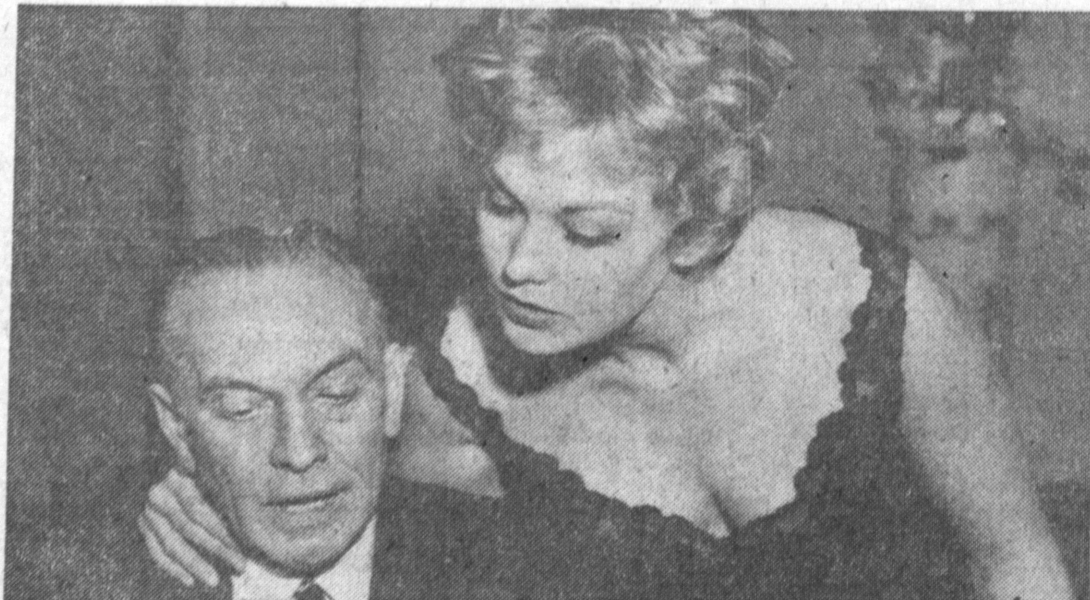
ROADIUM FEATURE — Kim Novak and Frederic March play leads in "Middle of the Night," now at Roadium Drive-ins with "Sabrina," (Hepburn, Bogart and Bill Holden).