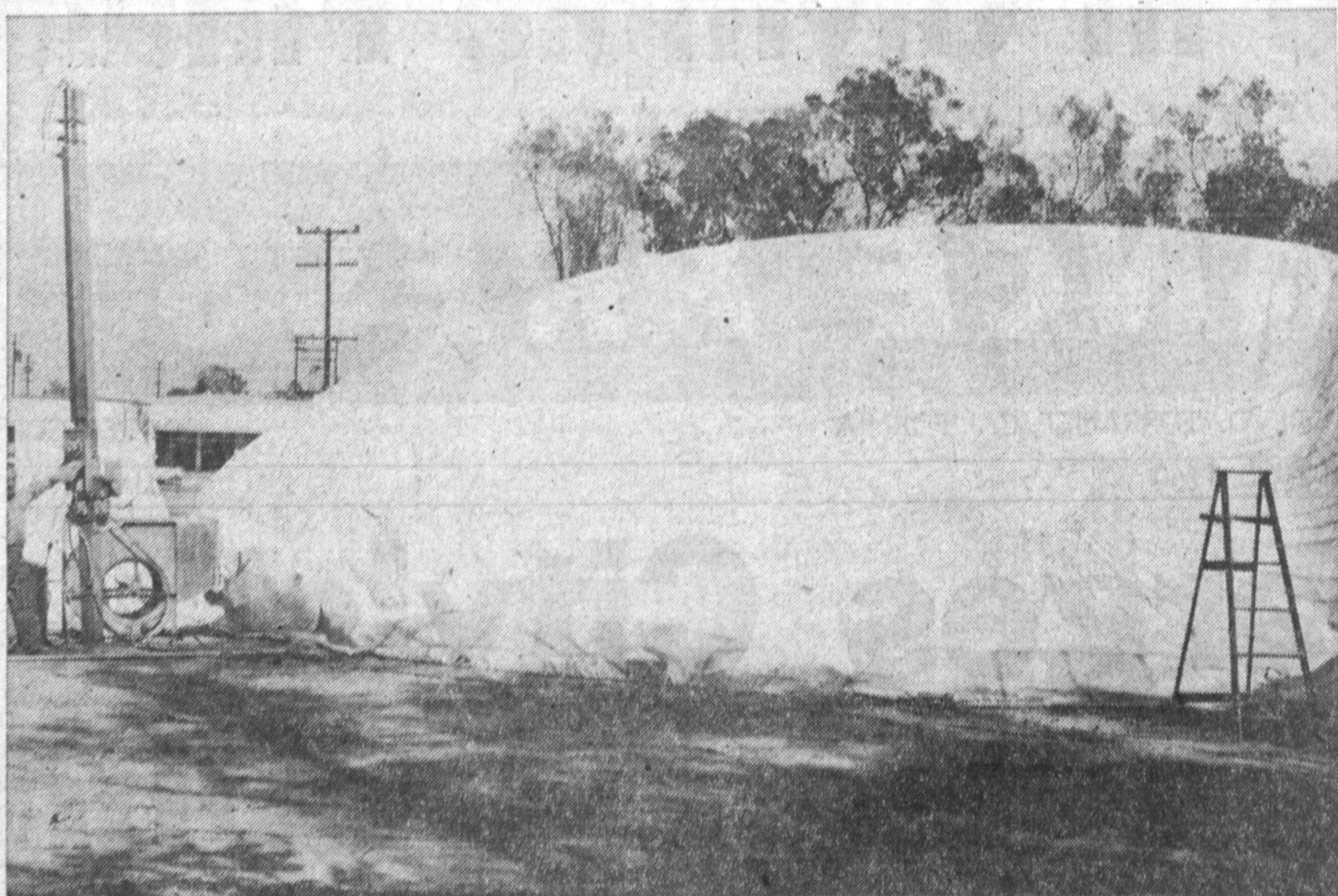
CATHEDRAL FOR TORRANCE—Huge new balloon-type building is inflated on Crenshaw just south of Carson for services that will start next week. Low-pressure air holds it up.