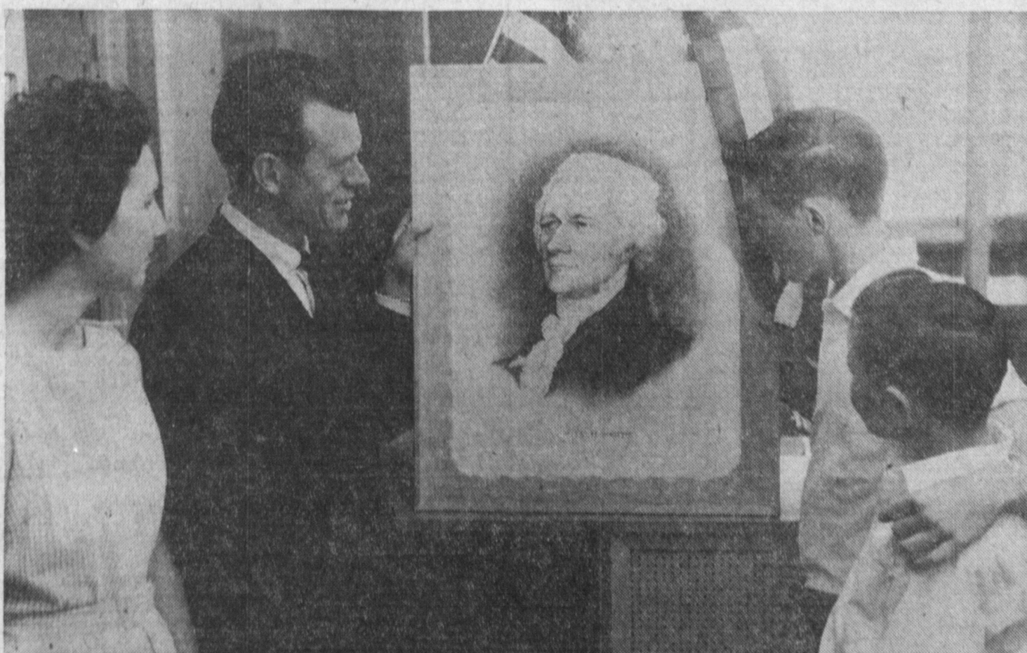
SCHOOL NAMESAKE —Hamilton Elementary School recently was presented a picture of Alexander Hamilton. The picture was painted by the wife of the principal of Jefferson