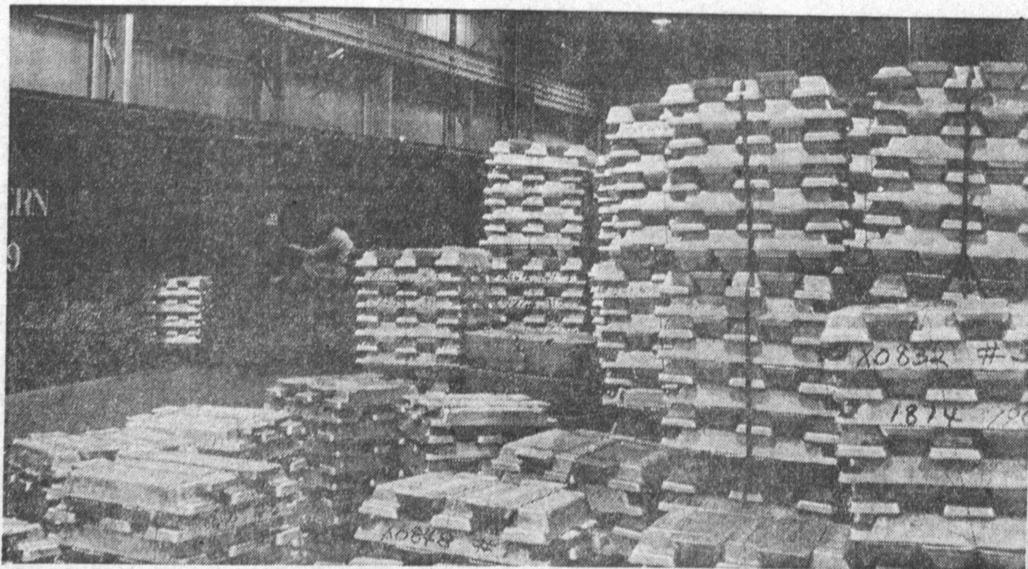
PRIMARY ALUMINUM—Bars of aluminum are loaded on freight cars at the Harvey reduction plant in The Dalles, Ore., for shipment to the company's fabrication mill here and to fabricators at points throughout the U. S.

Ore., for shipment to the company's fabrication mill here and to fabricators at points throughout the U. S.