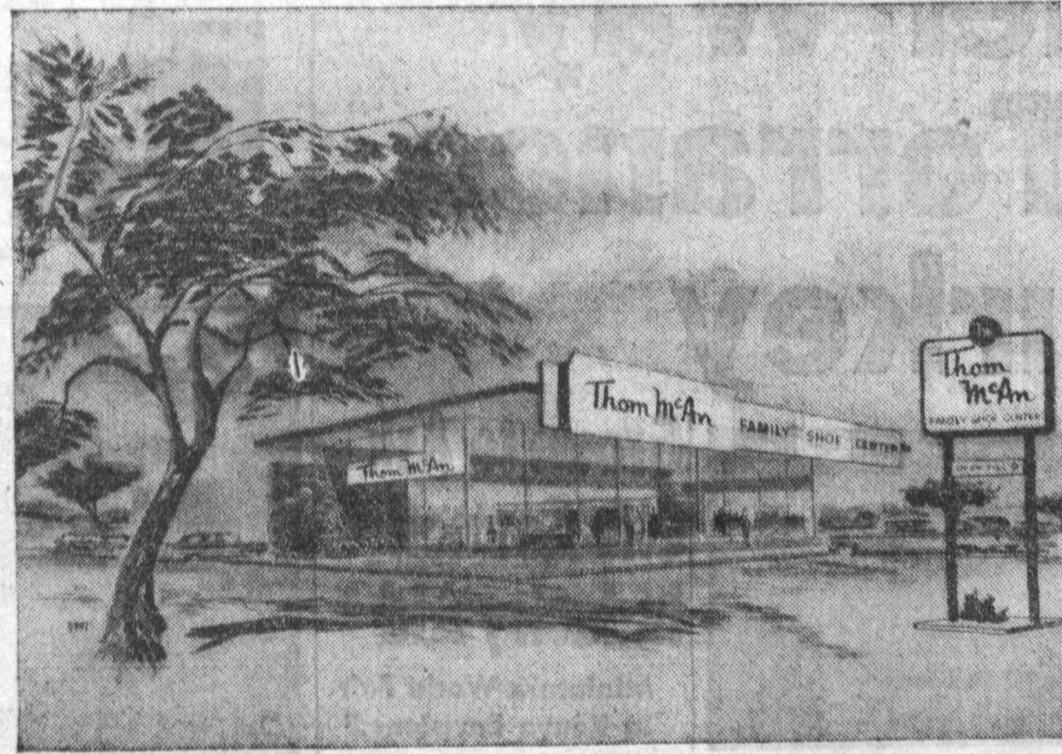
NEW STORE HERE—Thom McAn store at 159th St. and Crenshaw will open March 17.