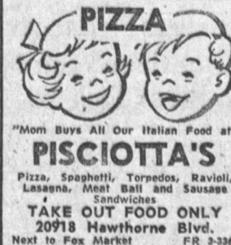
"Mom Buys All Our Italian Food at" PISCIOTTA'S PIZZA, Spaghetti, Tortes, Ravioli, Lasagna, Meat Ball and Sausage Sandwiches. TAKE OUT FOOD ONLY 20918 Hawthorne Blvd. Next to Fox Market FR 3-3360

A theater bus trip to a performance of "The Fourposter" is planned March 4 under auspices of the Torrance Recreation Department. Imogene Coca and King Donovan star in the poignant story of a marriage. The play, a New York hit several seasons ago, is on the boards now at the Pasadena Playhouse. The bus will leave the Home Savings and Loan Association office, 1511 Cravens Ave., at 7 p. m. Cost of theatre admission and transportation is $2.75. Reservations may be made at the Recreation Department office, FA 8-4108. March 1 is the deadline.