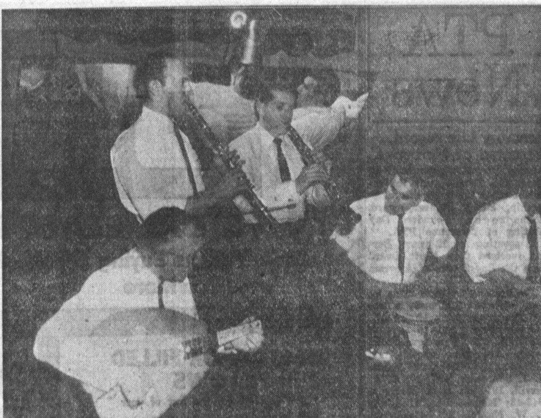
SUNDAY SERENADE —Shish-Ke-Bab Boys appear every Sunday at Berkshire Inn, 13518 Crenshaw Blvd., Gardena, featuring old Armenian music, food, atmosphere to match.