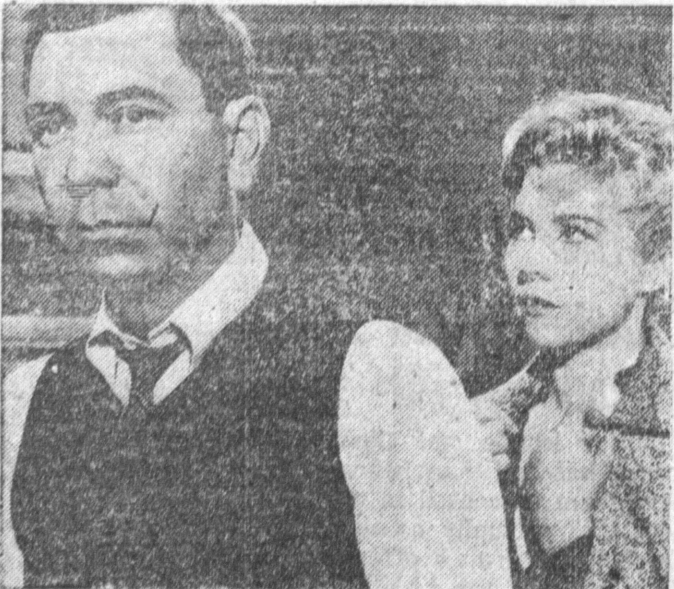
AUTHENTIC —Jack Webb as Sam Gatlin, newspaperman, and Whitney Blake as his wife, Peggy, in a dramatic scene from "30-1," a Mark VII Ltd. production for Warners. First authentic newspaper story in 28 years, current at the Radium.