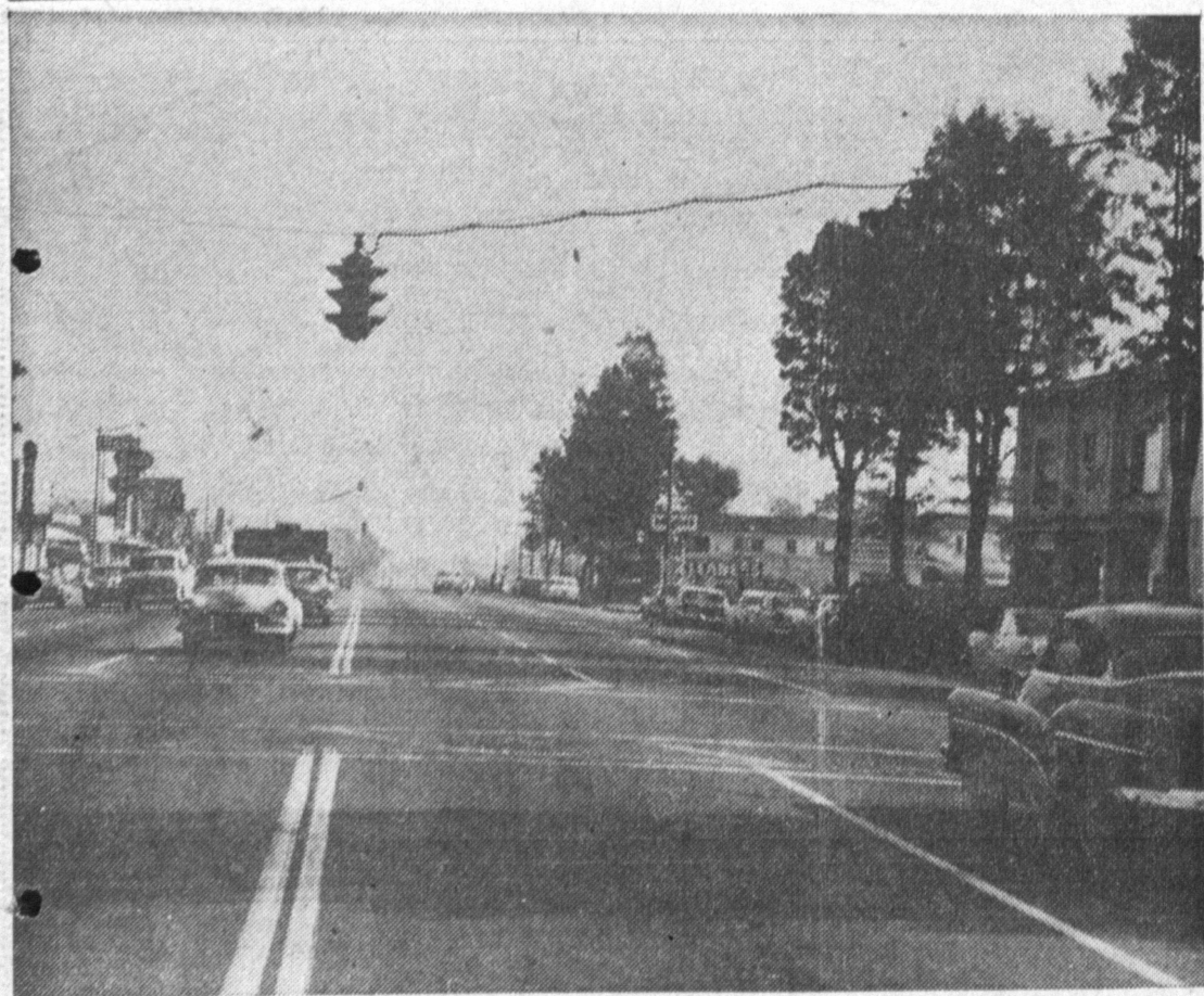
LIGHTS GO UP—In a new effort to make Torrance hanging traffic lights more visible to motorists, city crew attaches auxiliary