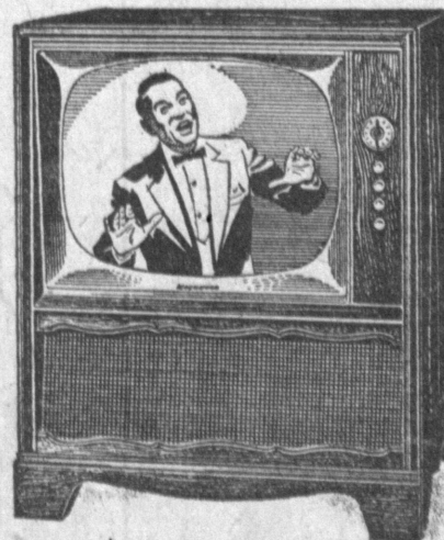
The MAGNAVOX CAVALCADE