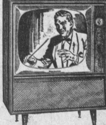
The Magnavox MAGNAVIEW 24