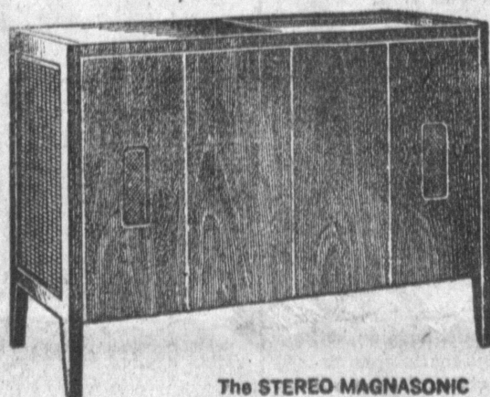
The STEREO MAGNASONIC