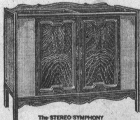
The STEREO SYMPHONY

SEE and HEAR The WIDEST VARIETY OF OTHER OUTSTANDING MAGNAVOX VALUES, TOO!