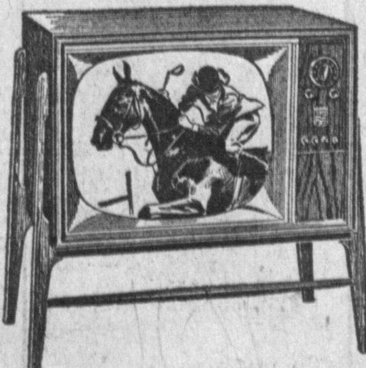
The Magnavox BOULEVARD 21

$299 50 in mahogany PHONOGRAPH ONLY . . . $269.50 in mahogany