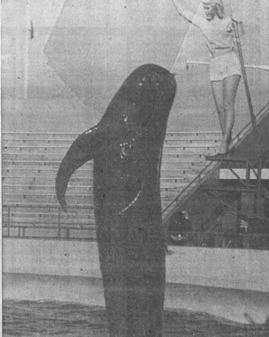
his first appearance at Marineland, put a male, joins Bubbles and Squirt, females.