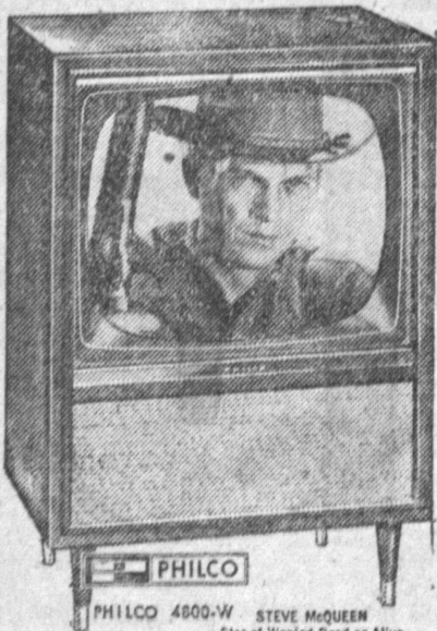
PHILCO 4600-W STEVE McQUEEN Star of 'Wanted Dead or Alive'

NEW LONGER LIFE . . . NEW SERVICE-FREE PERFORMANCE