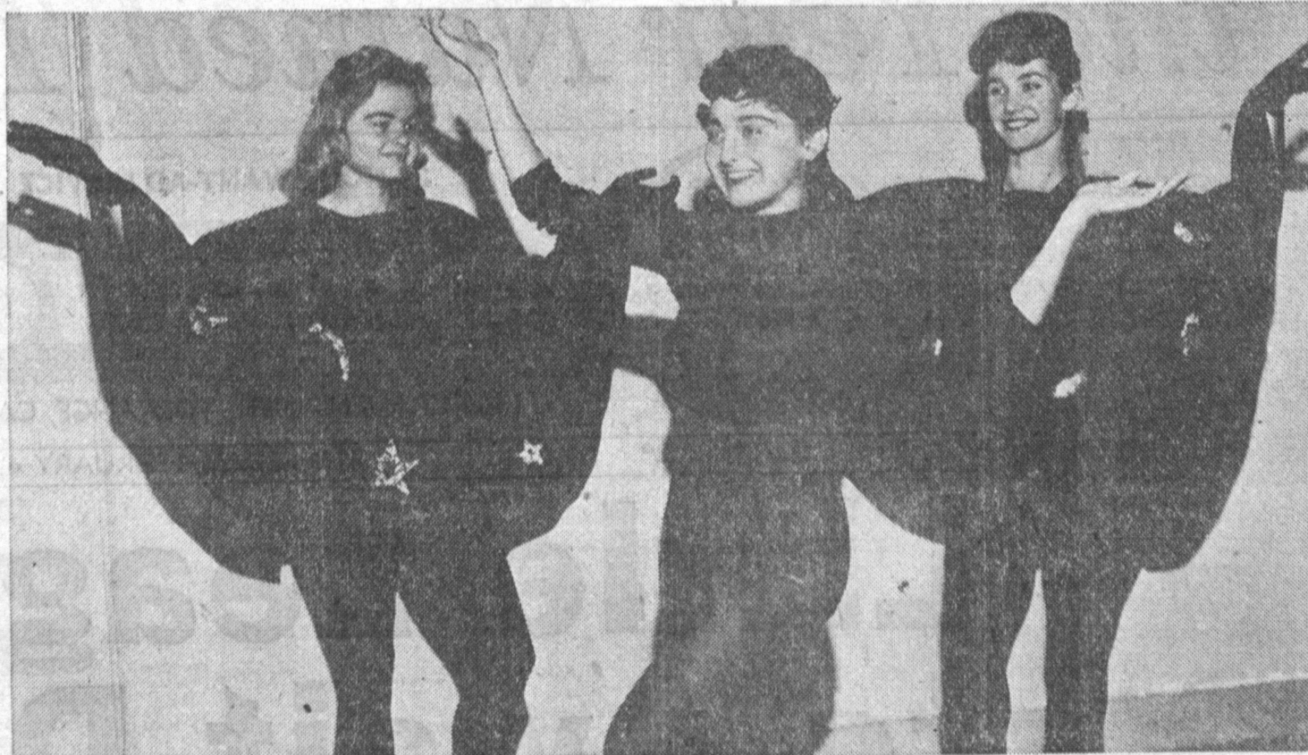
SORCERERS—Scene from "The Sorcerer," part of Torrance High School's 12th annual variety show to be presented tomorrow and Saturday at 8 p. m. in the school auditorium.