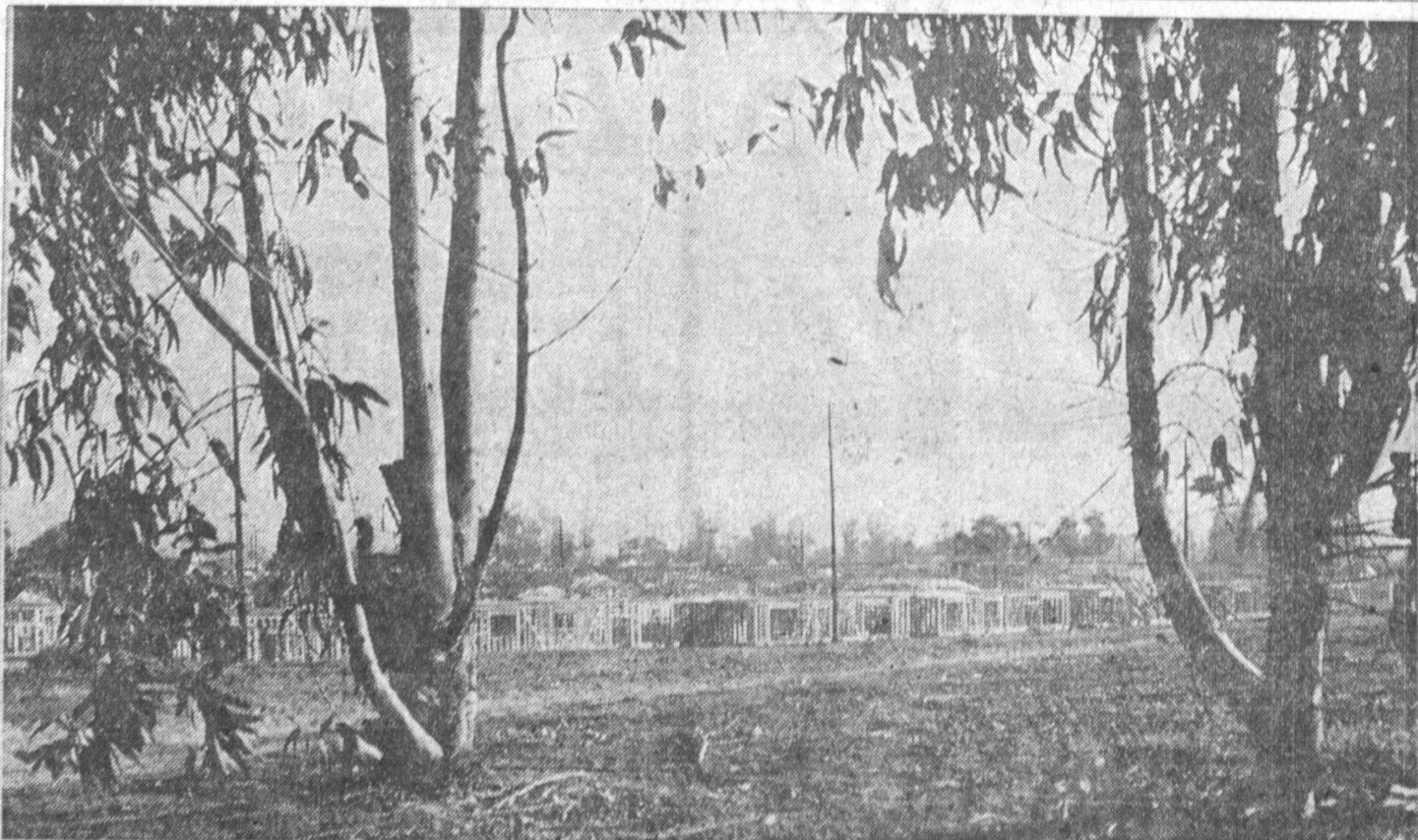
NEW DEVELOPMENT —Cabrillo-Wood Homes, being built on 230th St., between Arlington and Walnut, will be ready for occupancy in about three months. Featuring three floor

plans, and many elevations, houses are being built by Surf-riders, Inc., Lomita.