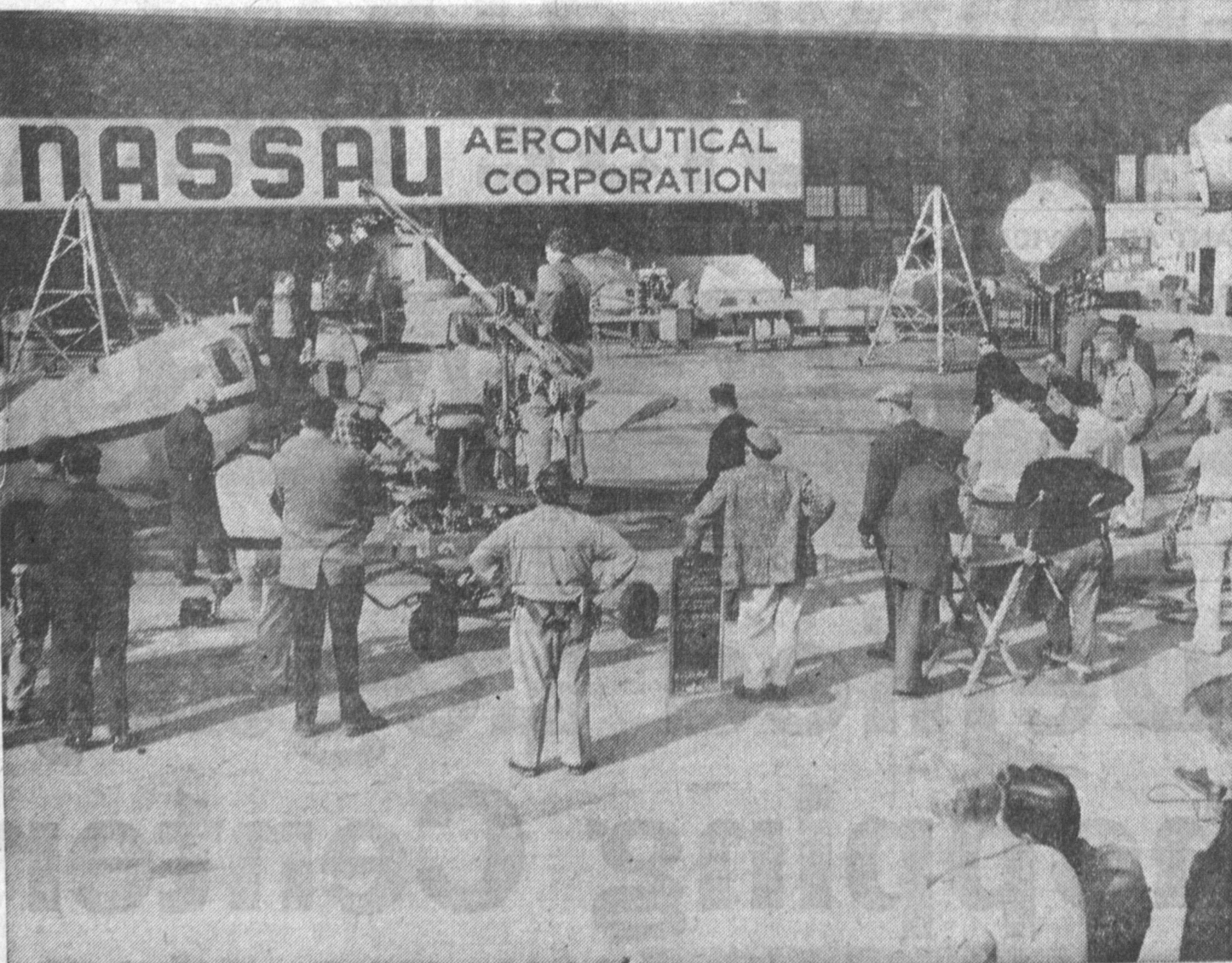
FILMED IN TORRANCE—Actor Paul Newman steps from Bonanza at Torrance Airport during 20th Century-Fox shoot.

ing of "From the Terrace," co-starring Joanne Woodward. Studio crew and stars were at airport for location shots.