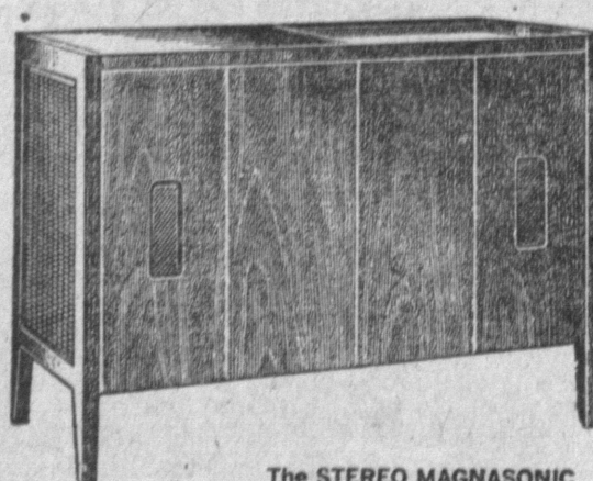
The STEREO MAGNASONIC

SEE, HEAR and COMPARE these spectacular buys...NOW!