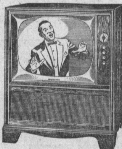
The MAGNAVOX CAVALCADE

YOU ALWAYS GET MORE FOR YOUR MONEY—WITH MAGNAVOX TV