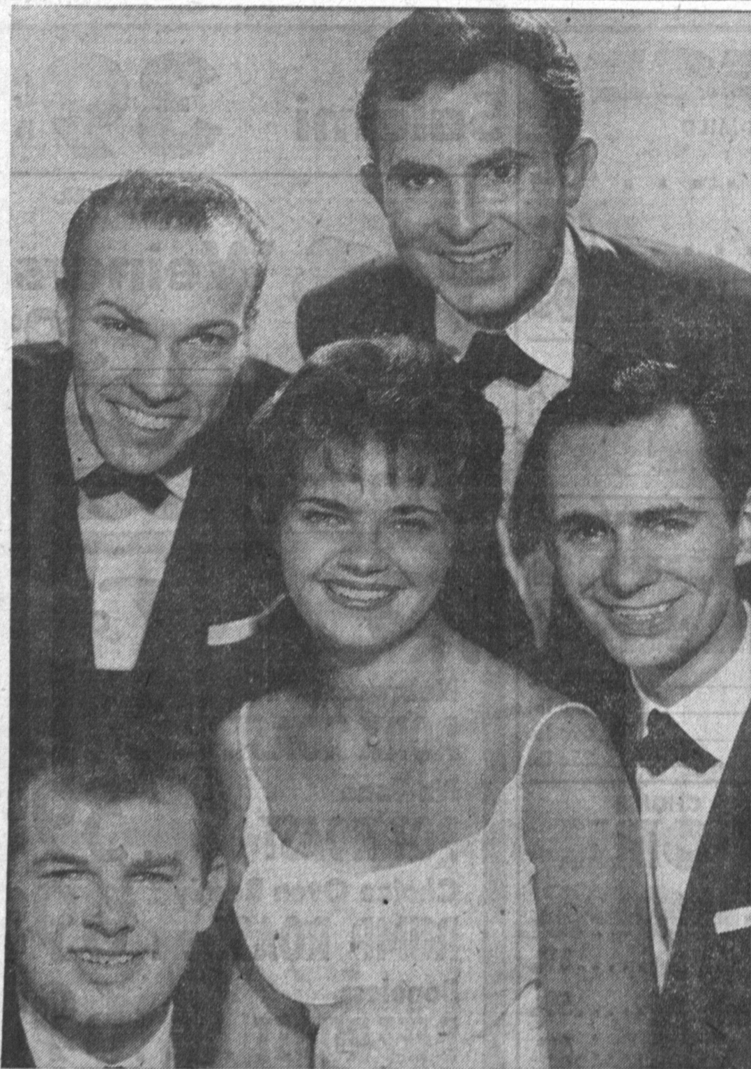
NEW SONG-AND-FUN TEAM —Currently entertaining at Marineland Restaurant in Palos Verdes is the sparkling quintet called The Celebrities. An instrumental-vocal group, with an accent on musical comedy, they just opened their initial engagement in the dining establishment's "Porpoise Room."

Use classified ads for quick results. Phone FA 8-2345.