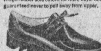
Won't scuff or scratch. Never need polishing in black or brown. Sizes 2 1/2-6, 6 1/2-12.