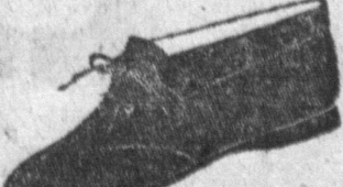
French corded in suede-soft black with crepe sole. Sizes 4-10.