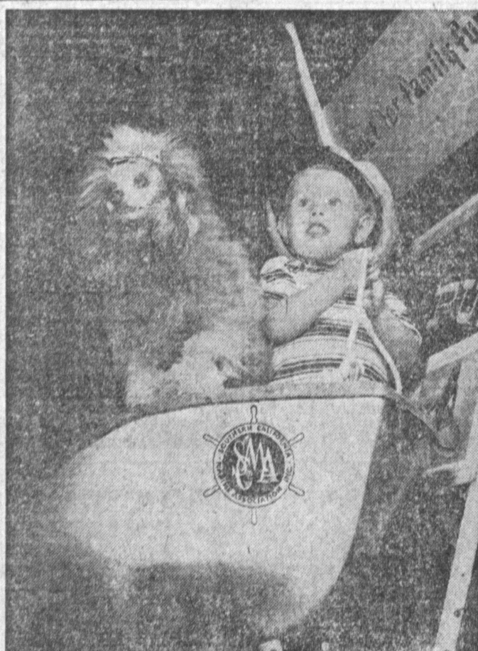
YOUNG SAILOR and his water-lovin' dog set their course straight for the Southern California Marine Association Boat Show at Great Western Exhibit Center, Jan. 8-17th. The biggest marine exposition in the West will bring to the public new models in boats (all sizes), motors, and marine accessories.