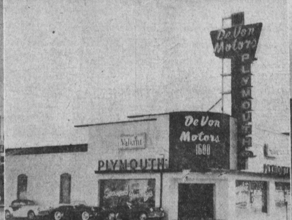
plete with champagne, Spudnuts, and coffee Saturday on Cabrillo Ave. in downtown Torrance. A dozen klieg lights will highlight a mad auction at 2 a.m. Five