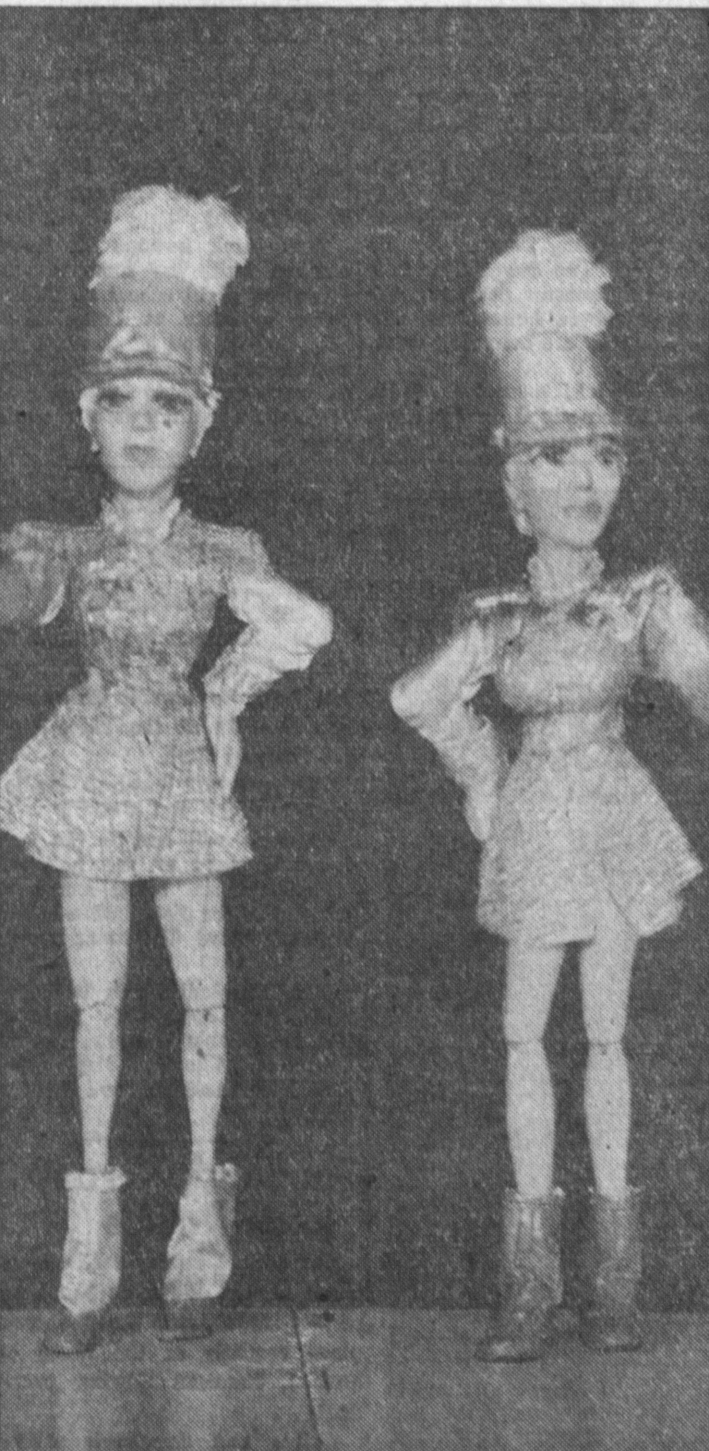
HOLIDAY REVUE—Van Winkle Marionettes will be feature attraction in Christmas show at the Broadway Del Amo Friday.

The navy will pay the last year's tuition, books, room, and board for student nurses. It provides opportunities for travel and education, recruiters said.