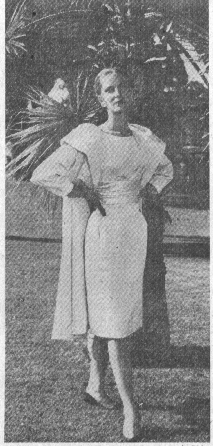
GLIMMERING GLAMOR—Pear-white silk moire cocktail dress with fully lined matching coat, $29.99 at Moore's Women's Shop.