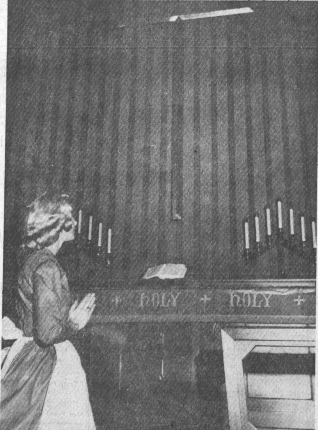
FOR WHAT WE HAVE--Miss Torrance Press prays this Thanksgiving day that what we have may become more abundant for all.