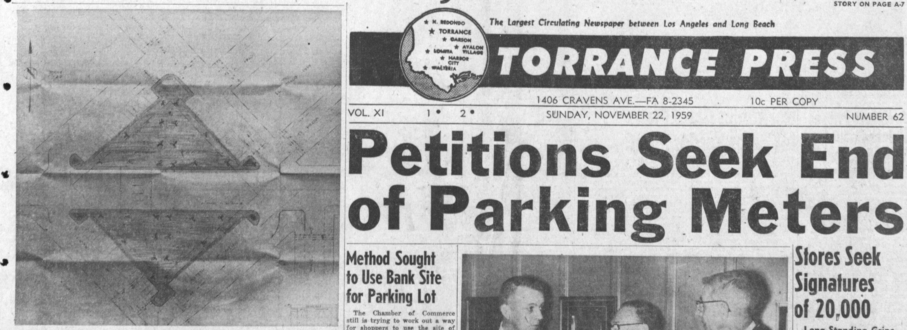
CARSON PLAN-Blueprint by former cityengineer to eliminate dangerous Carson St.