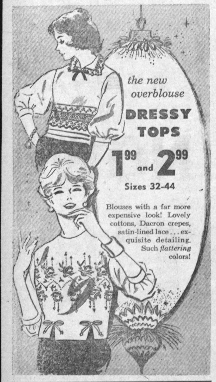
USE OUR LAY-AWAY PLAN