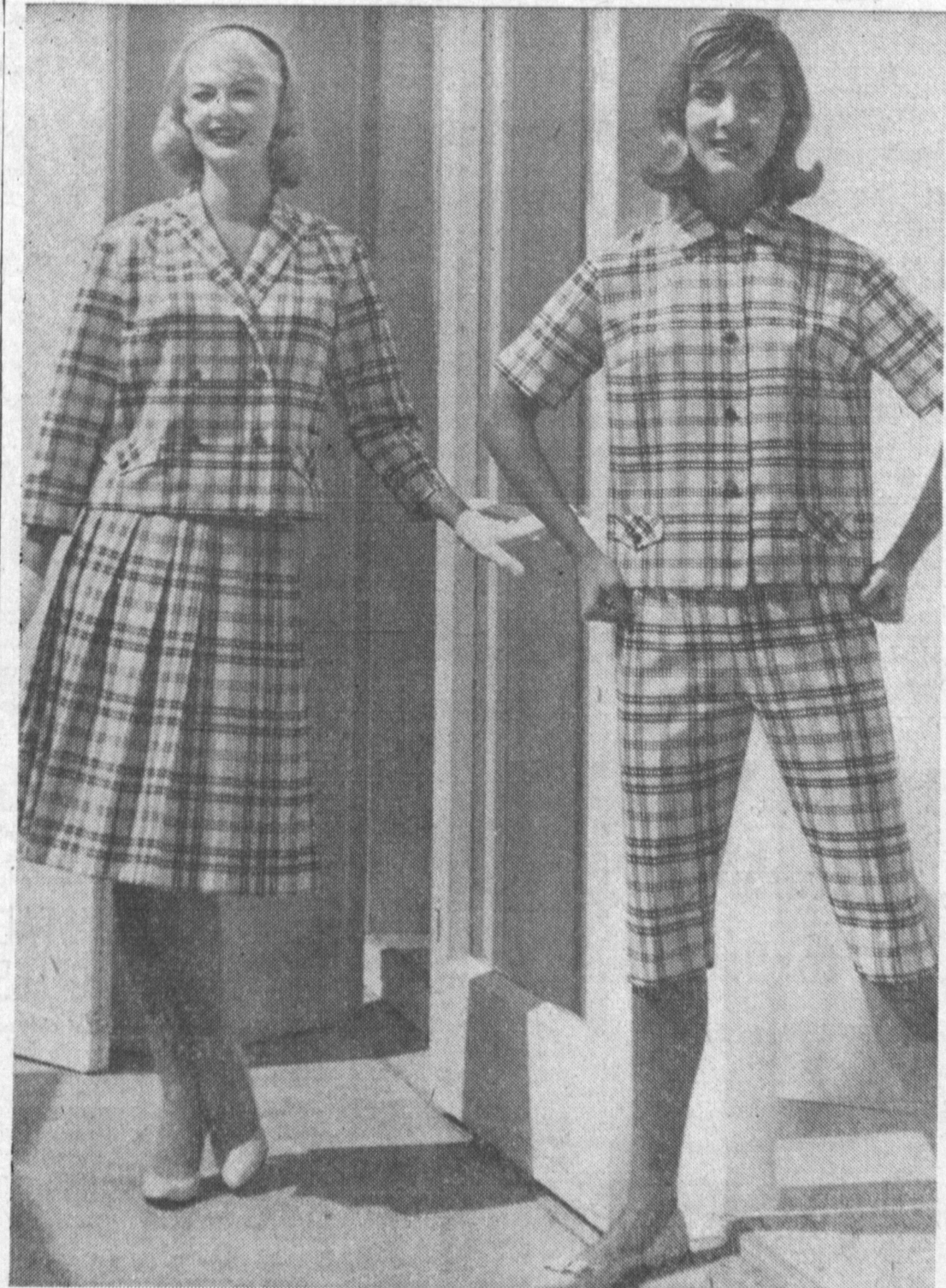
MISS PAT predicts for sun days, 1960: Tarpoon, a cotton plaid with outgoing personality. Left, the double-breasted jacket; the