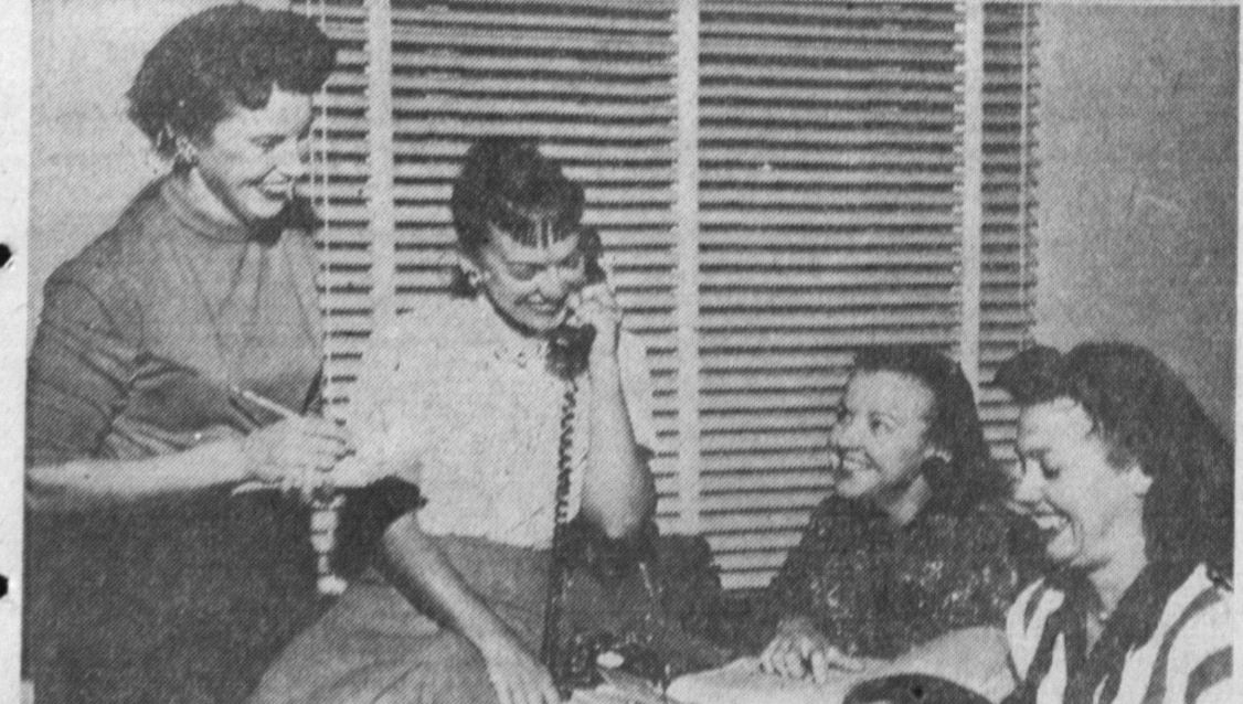
CREATION CONFAB-Officers of the Torrance JayCettes discuss plans for their getacquainted luncheon and fashion show Saturday at 12:45 p. m. at the Jumping Jack.