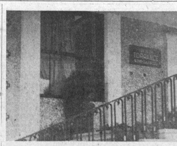
ENTRYWAY-Entire Konya population knows about its American counterpart as plaque displays name of civic auditorium. Remainder of legend is indecipherable to ye editor.

Use classified ads for quick results. Phone FA 8-2345.