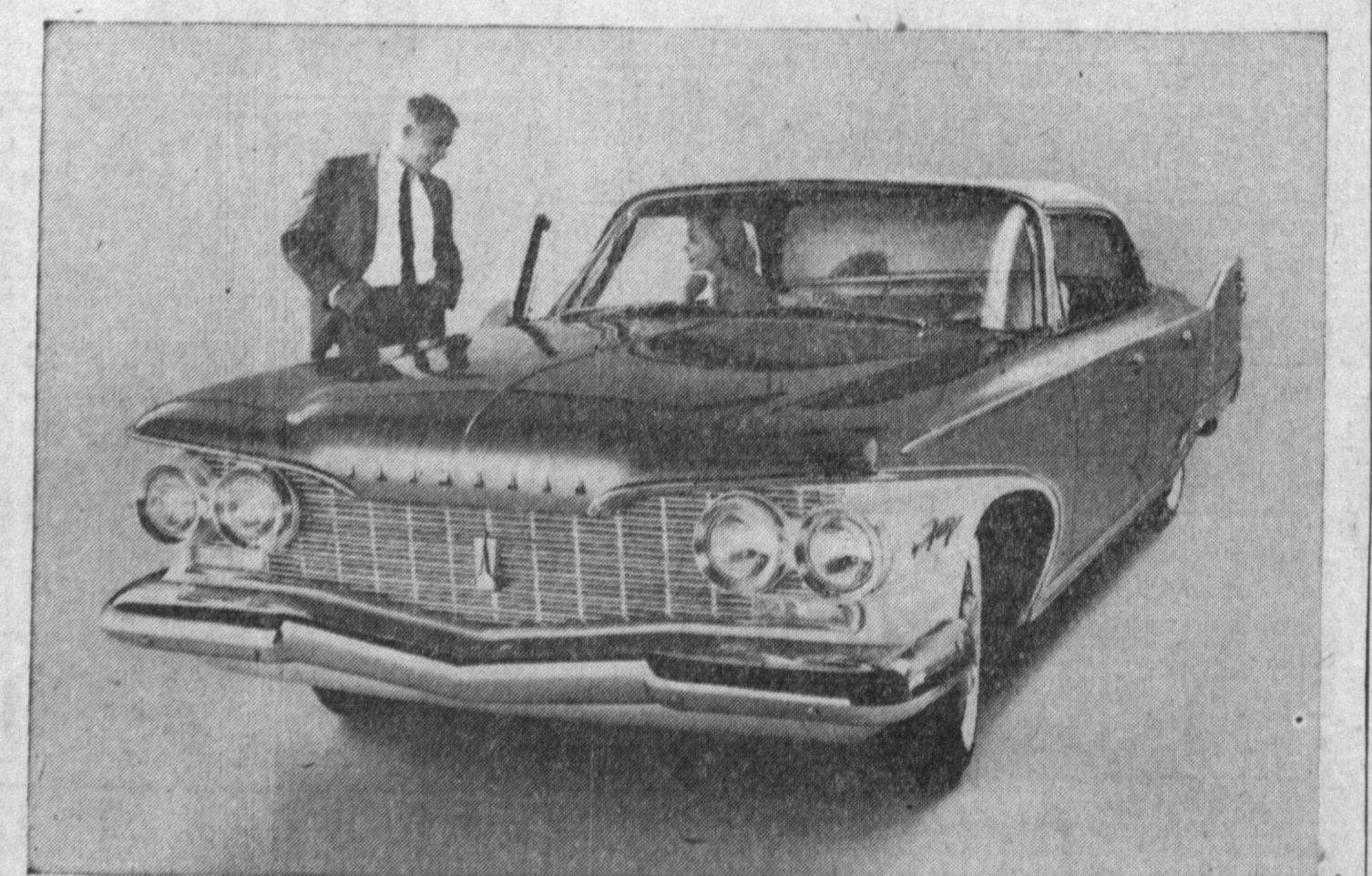
De VON MOTORS 1600 Cabrillo Ave. - FA 8-6161