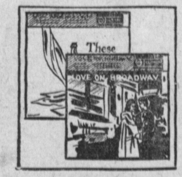
Save on Top Quality Record Albums

Clock face lights up in dark, audio jack for phonograph. Twin hi-fi