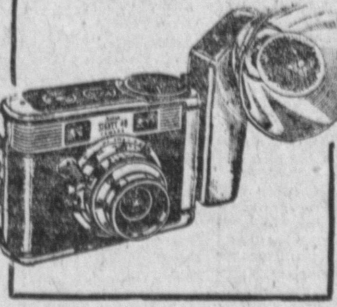
49.50 Kodak Signet '40' 35mm Camera

The top 10 monaural and top 5 stereo record albums now at this low,