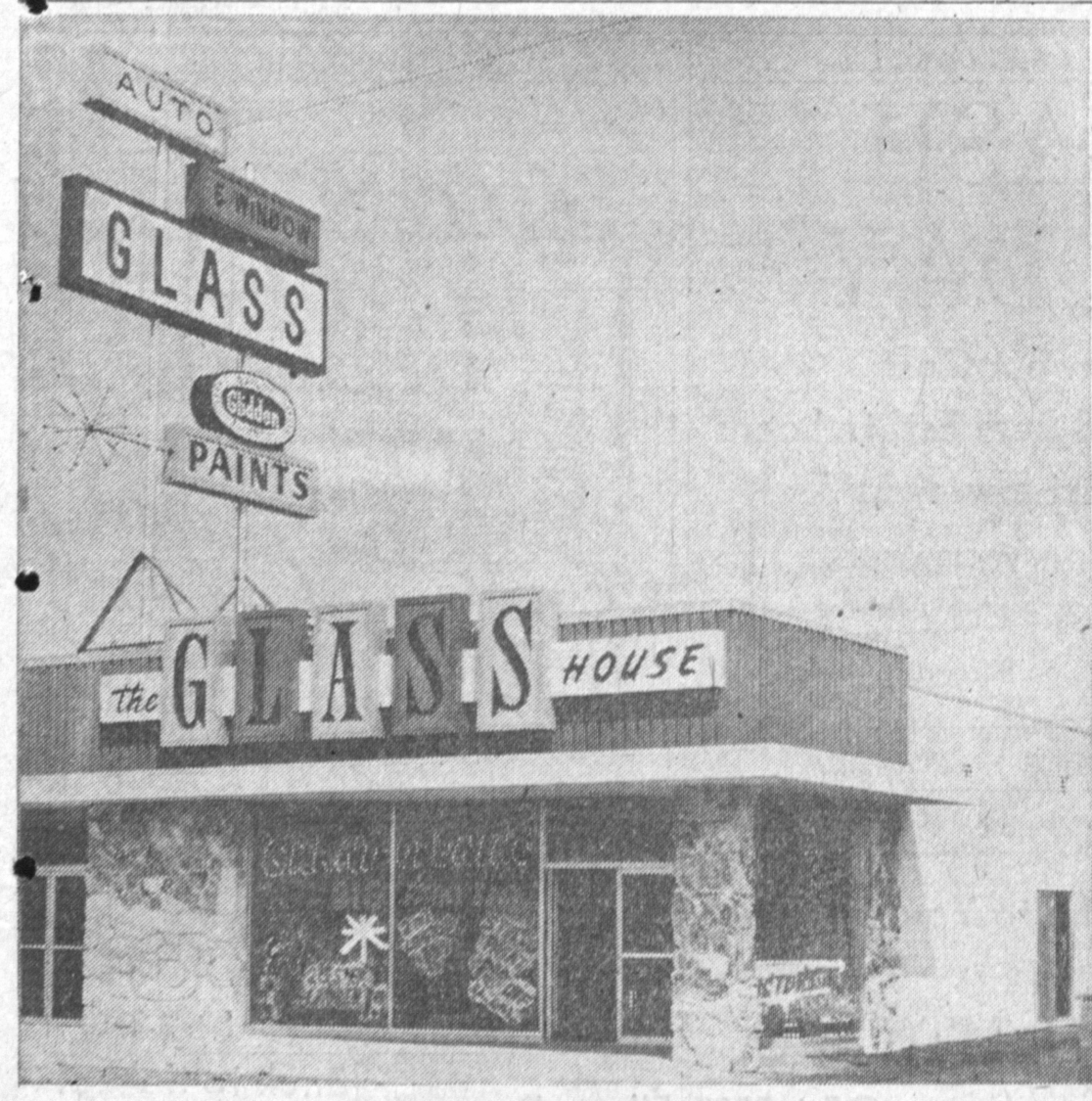
GRAND OPENING-Specialists in auto glass installation, the Glass House announces the grand opening of their new building at 15702 Hawthorne Blvd., Lawndale. The Glass House