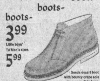
boots- boots- boots- 399 Little boys' To Men's sizes 599 Sturdy desert boot with bouncy crepe sole in grey or dirty buck.