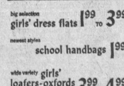
big selection girls' dress flats 199 TO 399 newest styles school handbags 199 wide variety girls' loafers-oxfords 399 TO 499 boys' girls' flexible cotton anklets 4 prs. 100