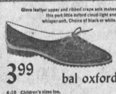
399 bal oxford 4-10 Children's sizes too.

NOT— 33 1/2 or 40 square yards that so many stores advertise as being average. Baker's advertises a price that is realistic. That is, a price including carpeting, labor, 50-ounce padding and chrome door metal stripping for 48 square yards which is about your required yardage.