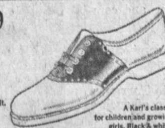
399 TO 499 Goodyear welt.