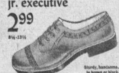
jr. executive 299 8 1/4-12 1/4 Sturdy, handsome. In brown or black.