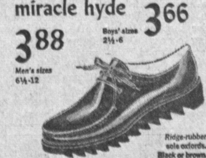
miracle hyde 366 388 Boys' sizes 2 1/4-6 Men's sizes 6 1/4-12 Ridge-rubber sole outsole. Black or brown.