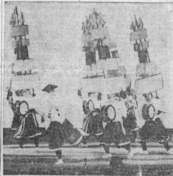
Scene from one of many colorful and superbly costumed productions to be presented by the celebrated Takarazuka Dance Theatre of Japan, coming to Shrine Auditorium in Los Angeles for seven performances starting Sept. 2. This marks first time large company has visited this country.