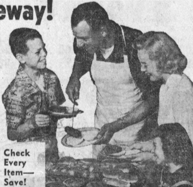
Check Every Item—Save!

HOT DOG ROLLS or BARBECUE BUNS Get several packages for your cook-out Pkg. of 6... 21¢