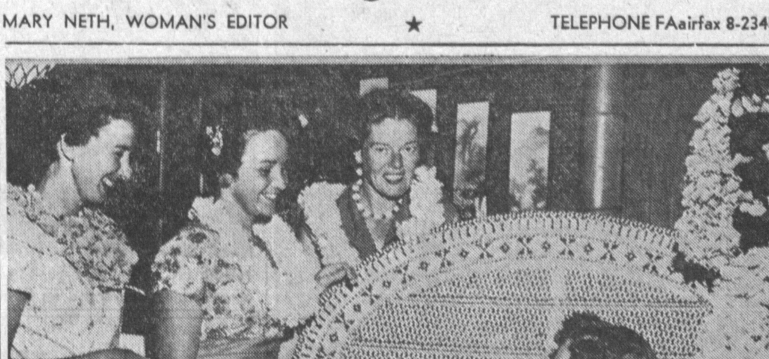
SUMMER BENEFIT-Members of the Tri Delta alumnae, chatting at the Polynesian party benefit was the largest affair ever held by the

square dances in other cities. Sponsored by So-Cub Incorpor- pleted here in September.