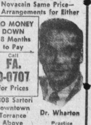
Torrance Above McMahan's