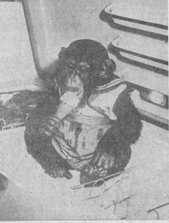
PLAYING IT COOL-Mickey, Palos Verdes Bird Farm chimp, seems to have the solution to beat the heat. He is making himself comfortable in a deep freeze and cools off his insides with