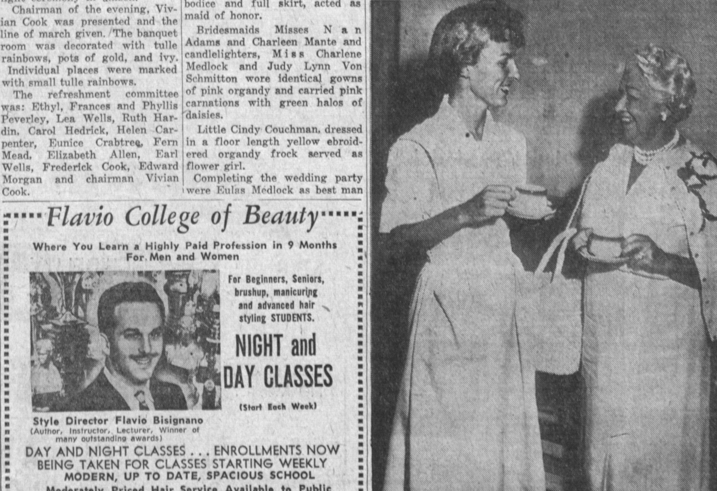
CHIC Uniforms were modeled at Tuesday's meeting of the Little Company of Mary's Hospital Auxiliary held at the St. Lawrence Martyr Parish Hall, 1960 Tulita Ave., Redondo Beach. The uniforms will be worn by the volunteers for the new hospital slated to open in Torrance this September.