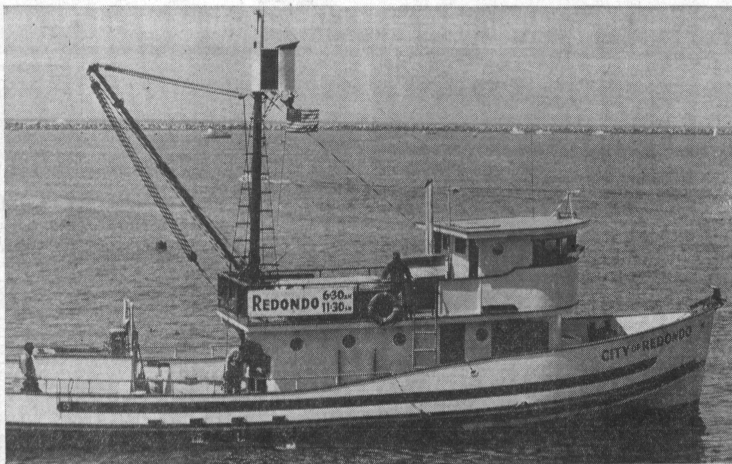
PLYING THE WATER is the City of Redondo Beach, largest half-day fishing boat, which leaves daily from Redondo Beach pier to where the big ones are caught. Its skipper, Jack Baker, has had charge of the vessel for six years.