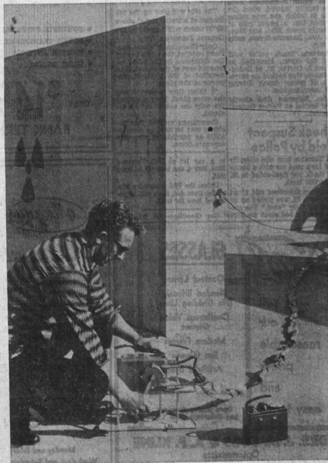
REMOTE CONTROL—The remote, mechanized handling of a radioactive cobalt 60 "pill" for radiographic examination of castings and weldments by National Supply Company in its Torrance plant is provided by this control unit outside the 18-inch thick, 7-ft. high concrete walls of this enclosure. The gate is closed and locked before the "pill" is propelled out of its lead storage safe. A Geiger counter (right) indicates radiation level and assures the safety of those conducting tests.

A move to lease a corner of Torrance Municipal Airport for a service station site was narrowly defeated by a 4 to 3 vote. The Airport Commission had recommended immediate lease of the 150x150-foot corner in order to receive revenues for the city.