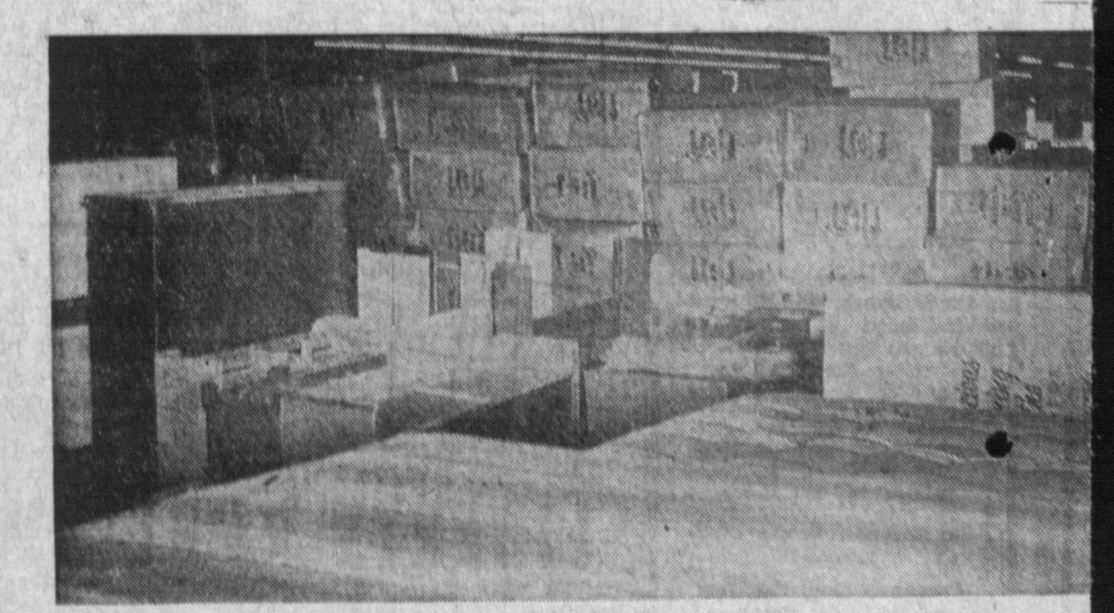
home furnishings during its Anniversary event days. with price tags you wouldn't dream possible.

BURSTING AT THE SEAMS, Rand Furniture Just name it - you'll find it at 14814 Sou will be loaded with every conceivable kind of Hawthorne boulevard during th enext fire