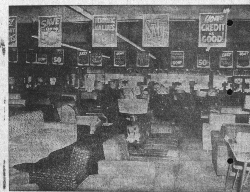
MONEY SAVING values galore are all ready row and lasts through Sunday. Besides offeri for Rand customers during the store's gala the best furniture bargains in the area, the Anniversary Sale which gets underway tomor- will also be free gifts for all the children.