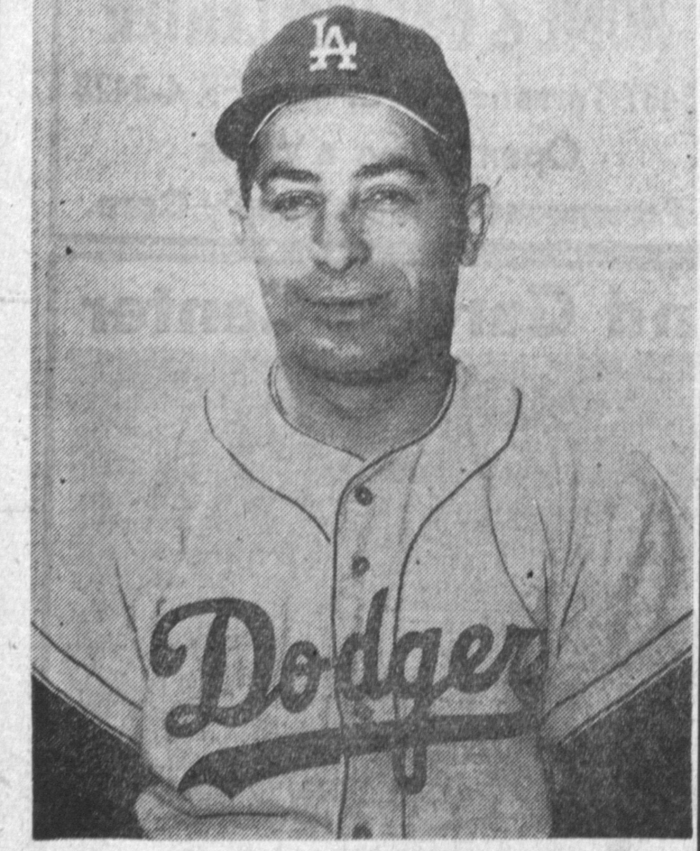
CARL FURILLO - L.A. Dodgers Carl says-Bring the family; see the star of Daddy Long Legs on stilts, 15 feet tall; and Bo Bo, the clown

$150,000 INVENTORY GOING -GOING FOR $68,500 - HURRY!!