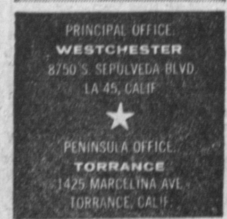
Use Torrance Press classified ads. Phone FA 8-2345.