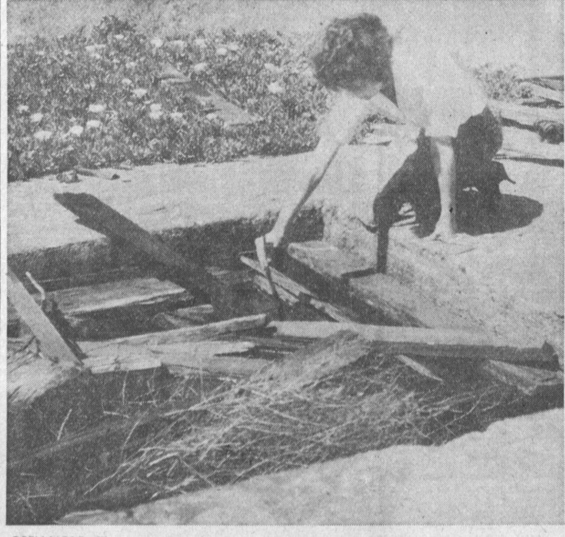
OPEN HOLE-This open cellar, which once was The structure is eight feet deep, and a child covered by an oil well poses a hazard to chil- casily could drown in it. dren who might fall into several feet of water.

"gouged" by the firm. (Continued on page two)