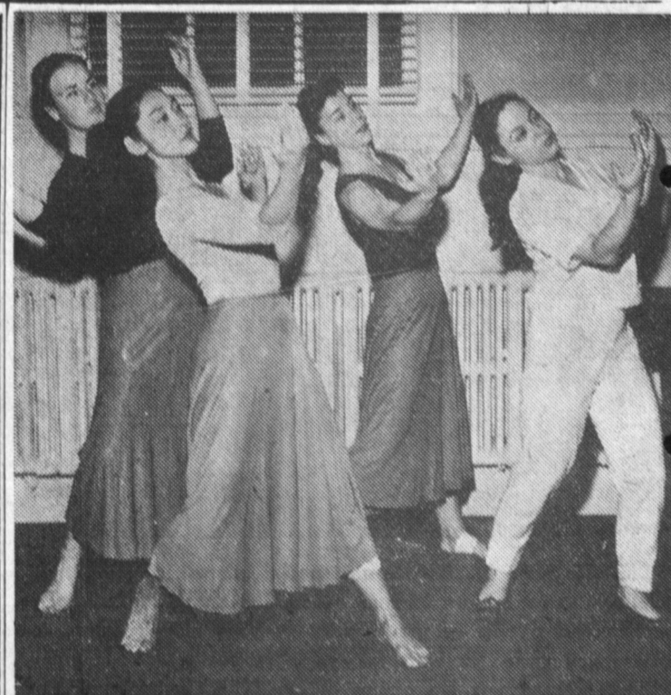
ART FESTIVAL—Dancers to be featured in South Bay-Torrance Symphony Orchestra concert Saturday in Redondo High School are winding up rehearsals. Festival of Arts will also feature art exhibit and Mother Singers choral concert Sunday.