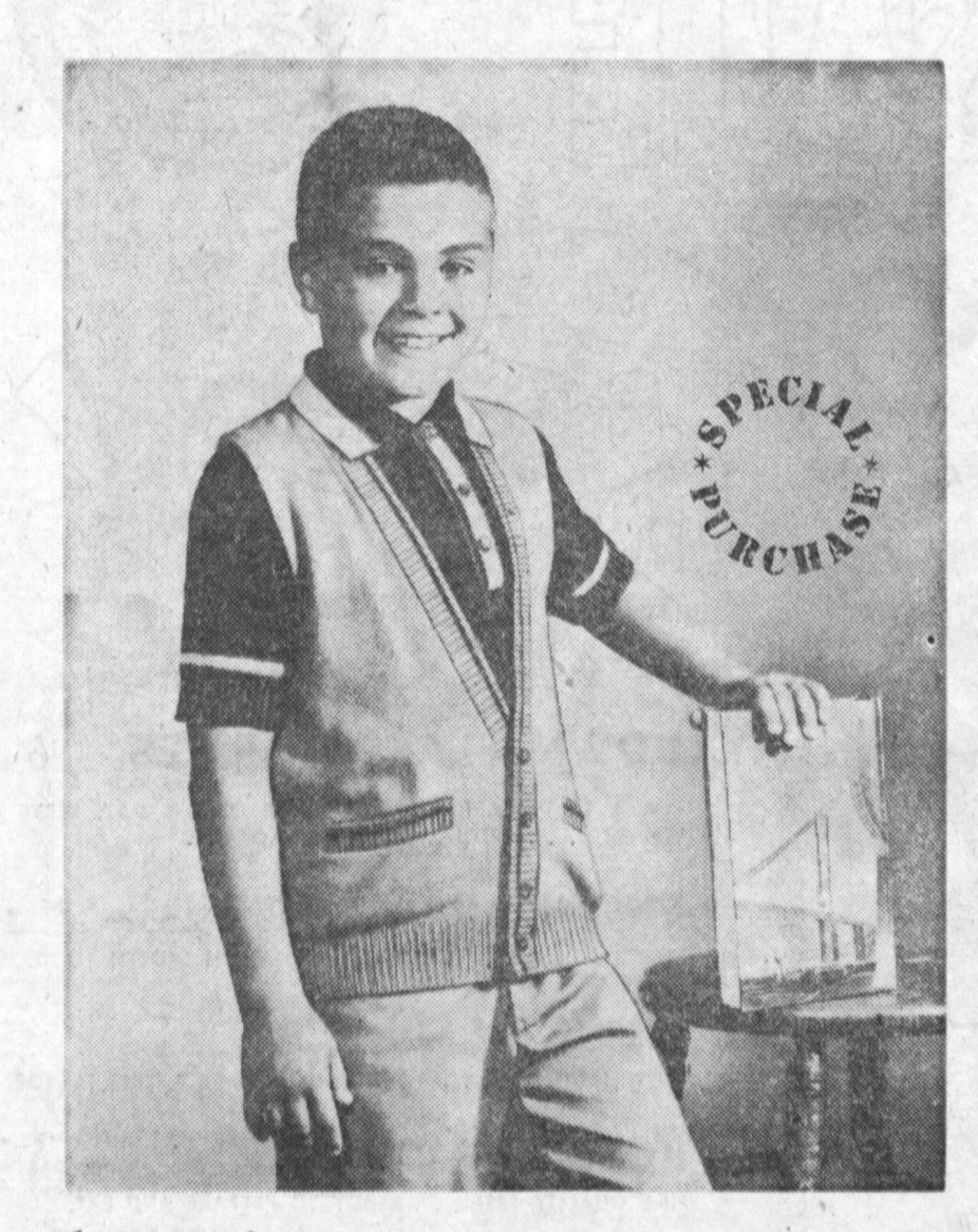
boys orlon sweater vests