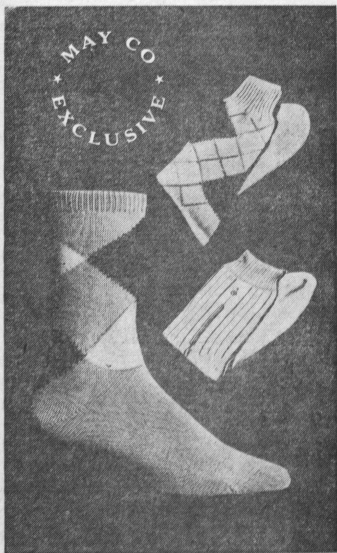
stock up time on macphergus socks