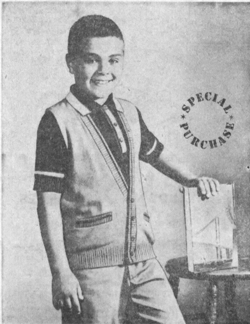
boys orlon sweater vests