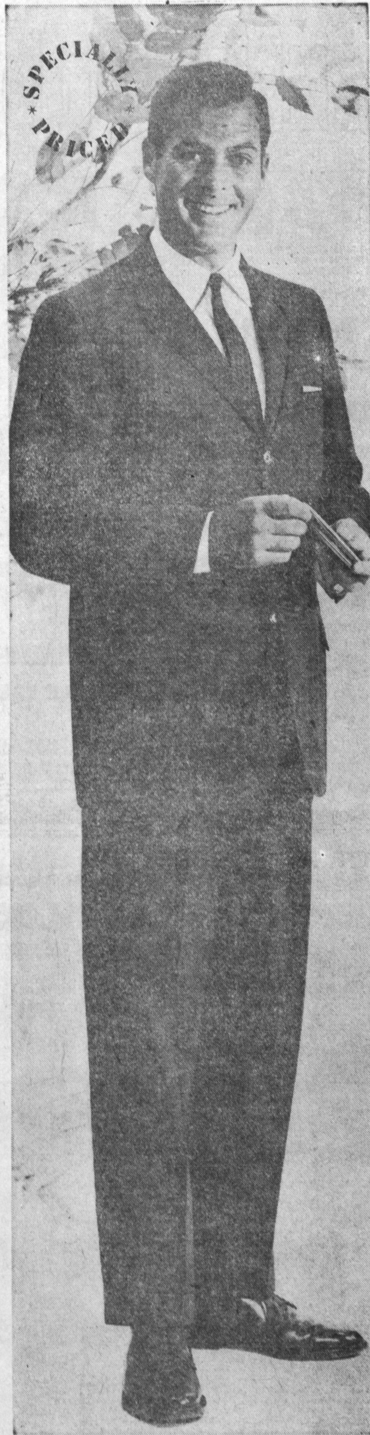
weightless comfort with dacron-wool tropical suit