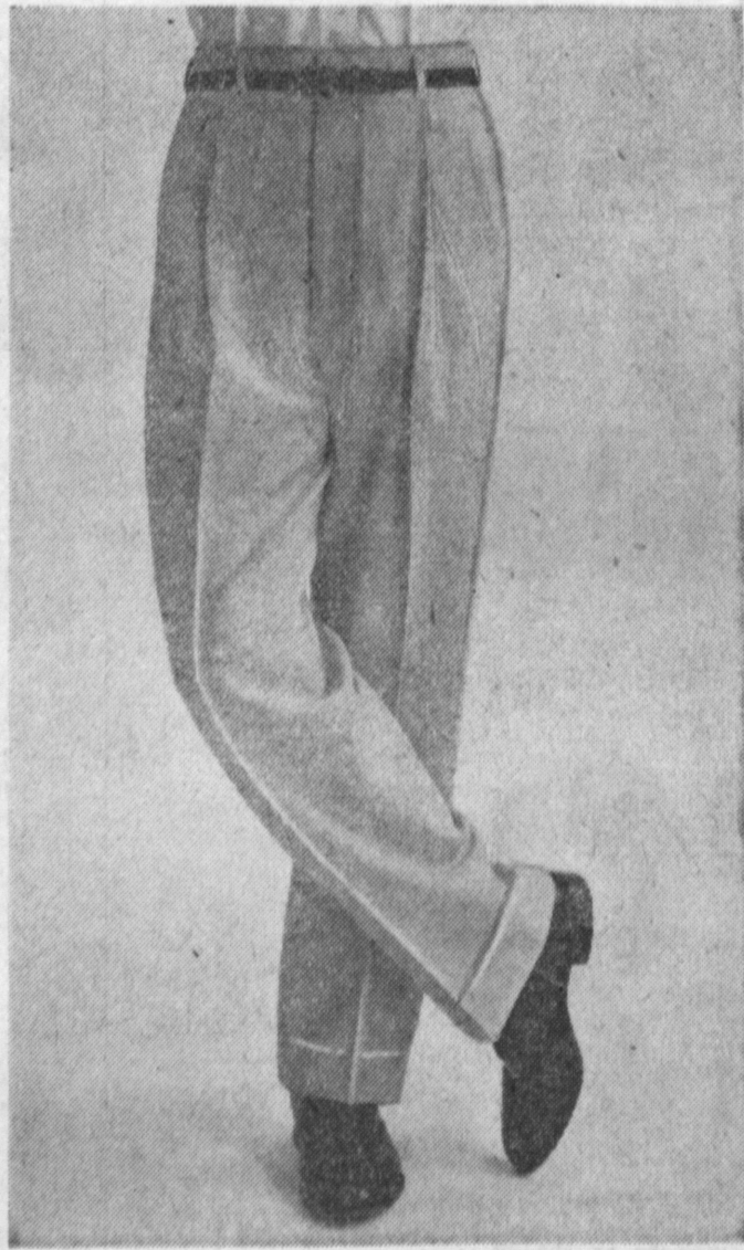
wash-n-wear dacron-wool slacks

Laboratory tested and approved. Shape retaining, shrink-resistant combed cotton fancy socks: all styles and colors. Sizes 10 1/2 to 13. Nylon stretch socks. Guar. one year against holes. No binding, drooping or sagging. Navy, brown, black, charcoal, tan, silver, blue. One size fits 9 1/2 to 14.