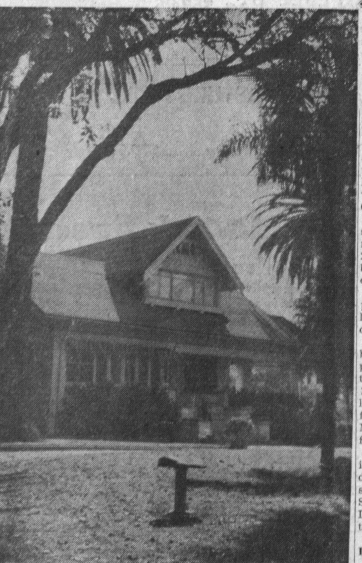
TO BE RAZED—The Carson home, which has been a landmark on Normandie Ave., just north of Carson St. since it was moved there in 1902, will be razed May 1 to make room for subdivision. Stately old trees which surround it will be offered to the city for use some other place.