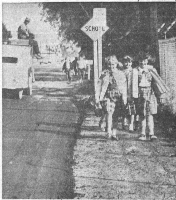
DANGER AREA —Students of the new Hamilton School are shown walking along the side of the street which has no sidewalks. On Thursday, city crews paved a strip, but some of the mothers insist that this has created an even greater danger since it is alongside and on the same level as the roadway.