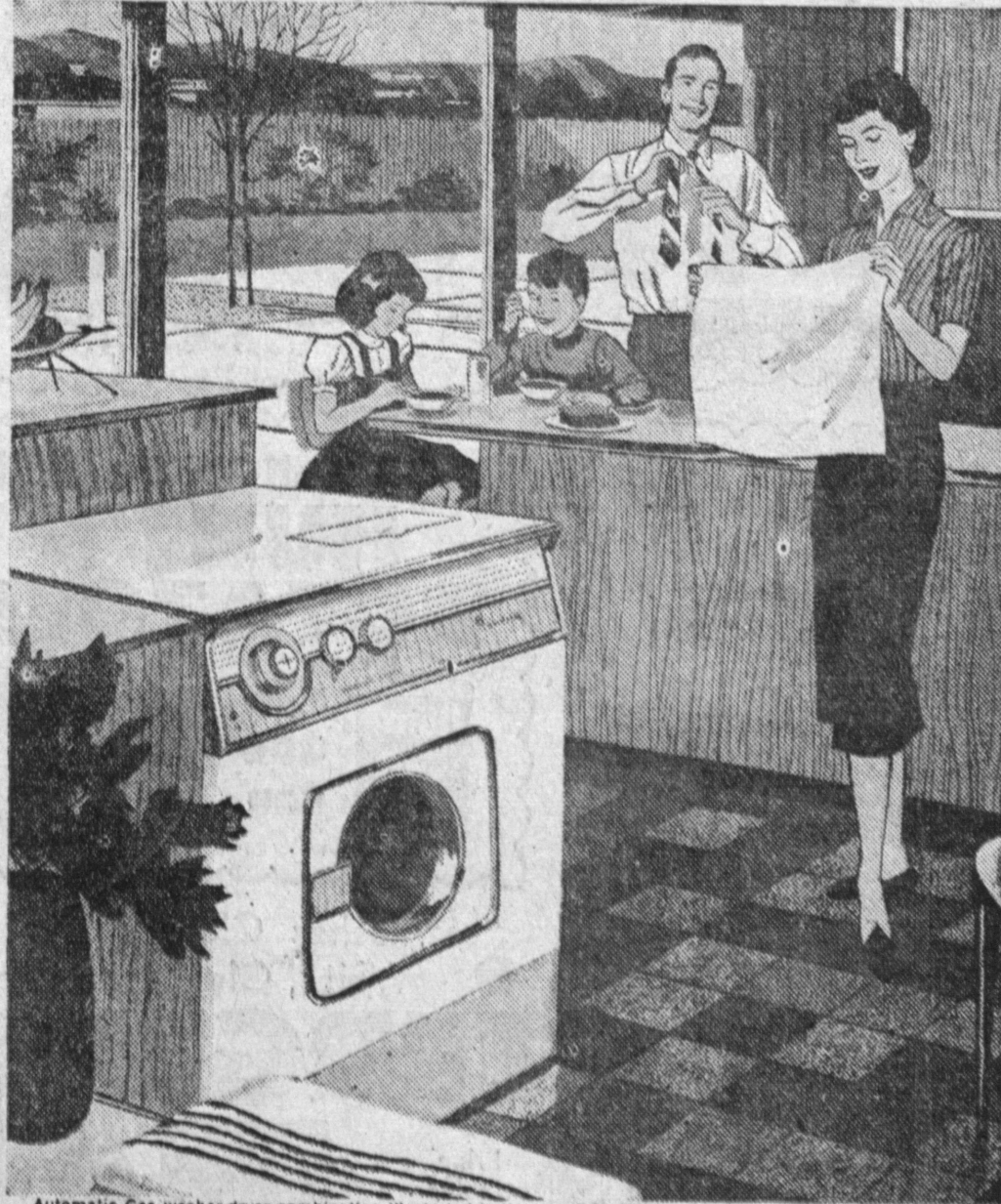
Automatic Gas washer-dryer combination illustrated is the new RCA WHIRLPOOL.