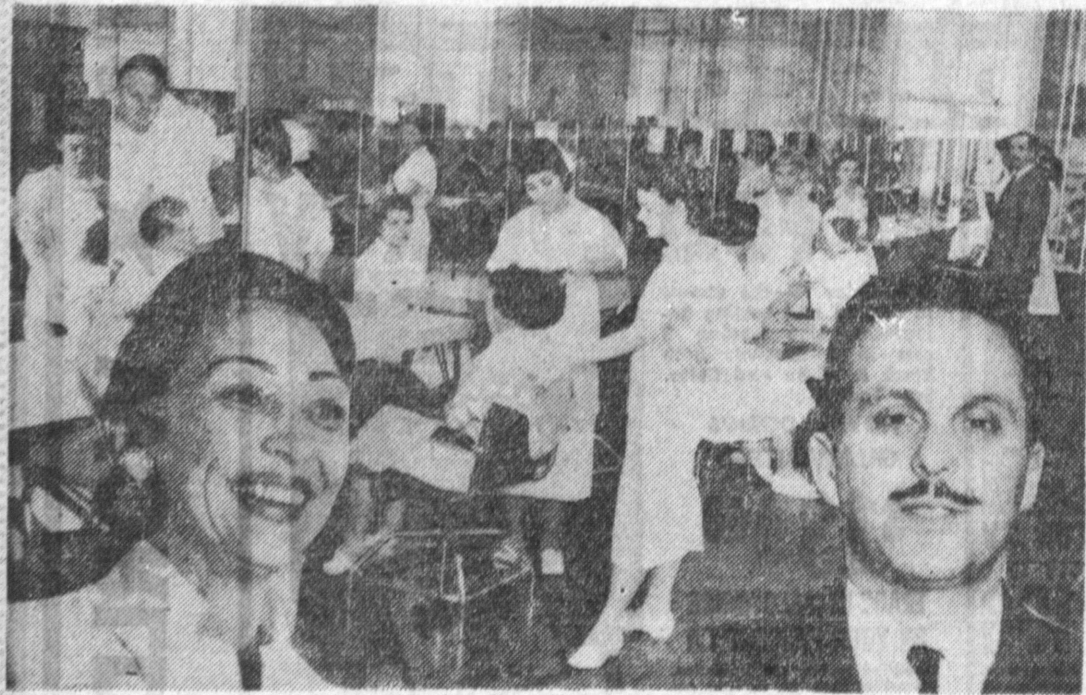
FLAVIO COLLEGE OF BEAUTY