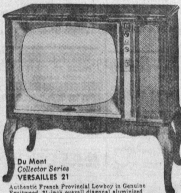
DuMont Collector Series VERSAILLES 21

Authentic French Provincial Lowboy in Genuine Fruitwood, 21-inch overall diagonal aluminized picture tube. Truly one of the most desirable television receivers in the world! W-31 1/2", D-18", H-32".